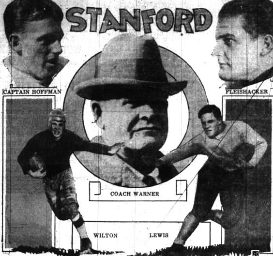
Stanford's backfield and coach.