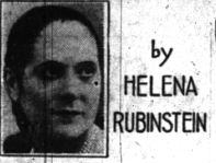
by HELENA RUBINSTEIN

If you have simply let yourself "run to seed" for weeks or months or years, one of your chief grievances will be the condition of your eye tissues. Either one of two things has happened. The flesh has relaxed and grown wrinkled, discolored and unhealthy looking, or heavy "puffs" have formed directly under the eyes.