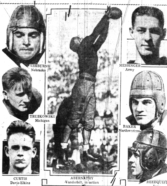
By BILL RITT Sports Writer for Central Press and The Eccentric

Fine ends are few and far between this football season, if games played to date can be judged as adequate tests.