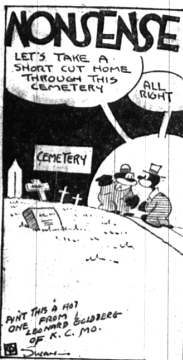
PUT THIS A HOT ONE DOWN ONCE AND FOR ALL UP TO YOU.