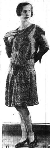
For the girl in her teens comes this small patterned silk frock with circular skirt and deep collar.