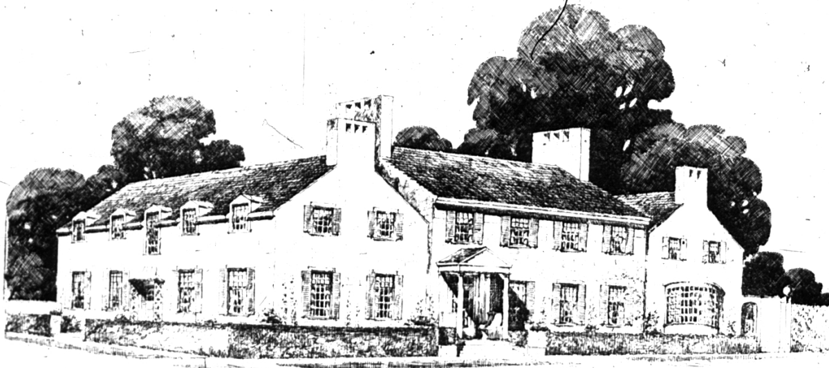
A drive for $125,000 to construct this lovely new Community House is now under way.