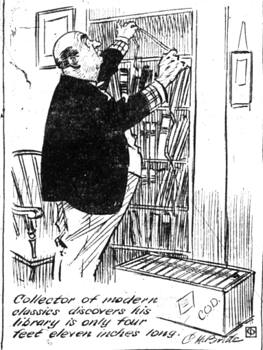
Collector of modern classics discovers his library is only four feet eleven inches long.