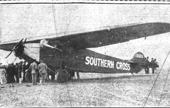
View of the giant monoplane Charles Kingsford-Smith, Australia, for Honolulu at the first leg of a trans-pacific flight which landed there successfully in the Fiji Islands.