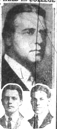
Sixes which his former college class manufactures.