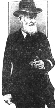
Here is the latest photo of George Bernard Shaw, English dramatist noted throughout the world, who, at 71, still remains a keen critic of the modes and manners of the day. He is shown in London, England.