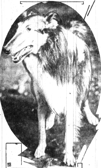
Shortly before the Hoover family sailed for South America, Glen, a handsome collie, was sent them from the Bell Haven Collie Kennels at Red Bank, N. J., to be the White House dog. Photo shows Glen, snapped on the lawn of the Hoover home in Palo Alto, Cal.