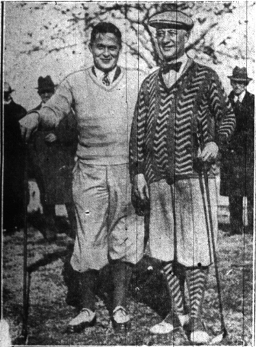
Bobby Jones, the Atlanta golf wizard, and Governor Alfred E. Smith, of New York, snapped at the East Lake Country Club, Atlanta, Ga., where they were partners in a golf foursome. According to a score card kept by Senator Pat Harrison, the governor turned in a better score than Jones, but spectators attributed the score to the congressional methods of tallying strokes.