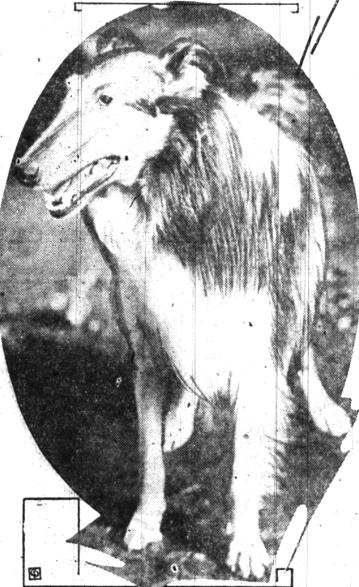
Shortly before the Hoover family sailed for South America, Glen, a handsome collie, was sent them from the Bell Haven Collie Kennels at Red Bank, N. J., to be the White House dog. Photo shows Glen, snapped on the lawn of the Hoover home in Palo Alto, Cal.