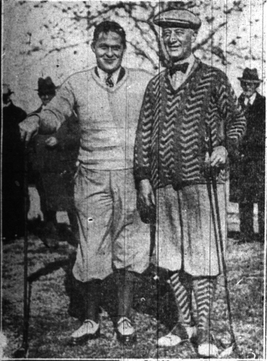
Bobby Jones, the Atlanta golf wizard, and Governor Alfred E. Smith, of New York, snapped at the East Lake Country Club, Atlanta, Ga., where they were partners in a golf foursome. According to a score card kept by Senator Pat Harrison, the governor turned in a better score than Jones, but spectators attributed the score to the congressional methods of tallying strokes.