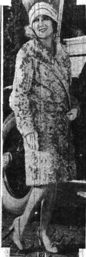
Mary Pickford poses at her home in Beverly Hills in a straight lined coat of gray baby carriage with gray felt hat and gray shoes