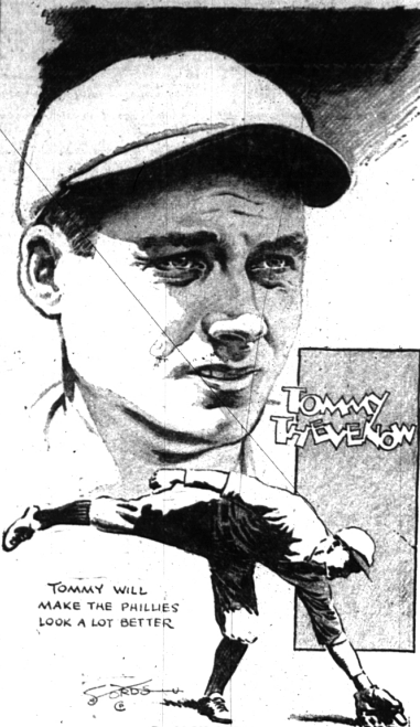
TOMMY WILL MAKE THE PHILLIES LOOK A LOT BETTER