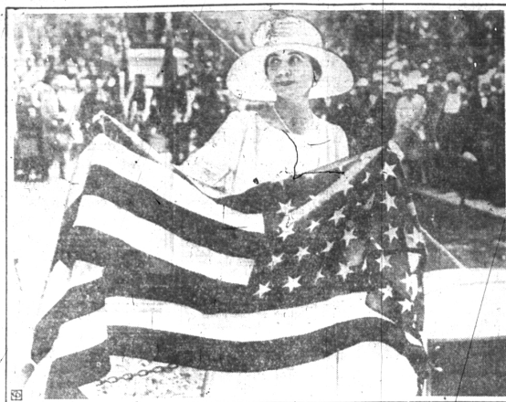
Latest photo of Mrs. Calvin Coolidge shows her unveiling a memorial to Col. William Colville, Civil war hero, at Cannon Falls, Minn., her first formal public appearance since the presidential family took up its summer residence in nearby Bruce, Wis.