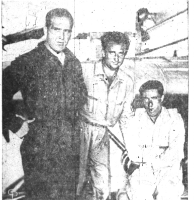
Left to right, Ruiz de Alda, Ramon Franco and Emilio Gallarza, Spanish musketeers of the air, who are winging the first laps of a round-the-world flight which they plan to complete in 45 days. The first stop was from Cadiz to the Azores.