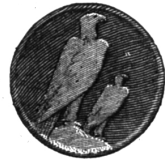
Identification: On the sidewall of this tire you will find in silver silhouette the Double Eagle, world mark of superior quality and value, symbol of that Goodyear union of seasoned experience and youthful progress which has produced the tire of tires.

H AVE a great 3-day vacation, and get yourself all fixed up for the winter months by having your car equipped with new Goodyear Tires. For with your car on brand-new, good-looking Goodyear Tires you'll be ready for months and months of trouble-free mileage. All Goodyear Tires are guaranteed for the life of the tire against defects in workmanship and material.