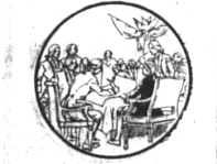
The signing of the Declaration of Independence was a great his-

"Blowing your own Horn" is a lot more fun than blowing the other fellows'. . . Especially if it's the first year away at college. . . and there's been rivalry to "make" the School Band! . . . Grinnell's Music Store, 121 N. Woodward Avenue, have a complete stock of marvelously toned musical instruments including the ubiquitous Ukulele. . . for "What is college without a "uke"!"