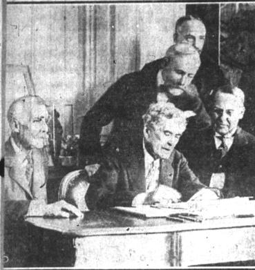
Ambassador Myron T. Herrick signing final papers in Paris, France, for the purchase of a site for the proposed new American embassy in the French capital. Secretary of the Treasury Andrew Mellon is at the ambassador's right.