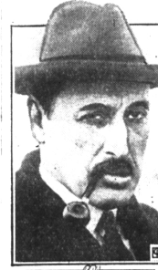
Count Michael Karolyi's alleged radical tendencies may again keep him out of the United States. The state department has announced it is prepared to refuse a visa to the former president of the Hungarian republic, who wishes to remain in the United States for two days on his way to Mexico.

A means of magnifying fingerprints as much as 500 times has been devised, making them more effective as court-room exhibits.