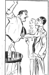
Let him without you cast the last vote against a wet.