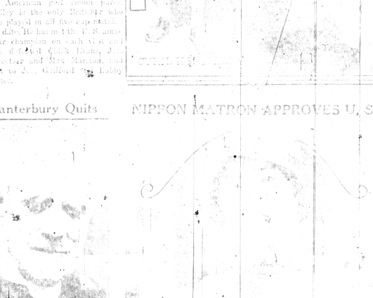
Portrait of a man related to the Canterbury Quits story.