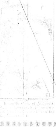
Portrait of a man seeking a Senate seat.