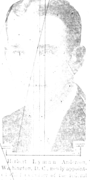
Portrait of a Trade Examiner.