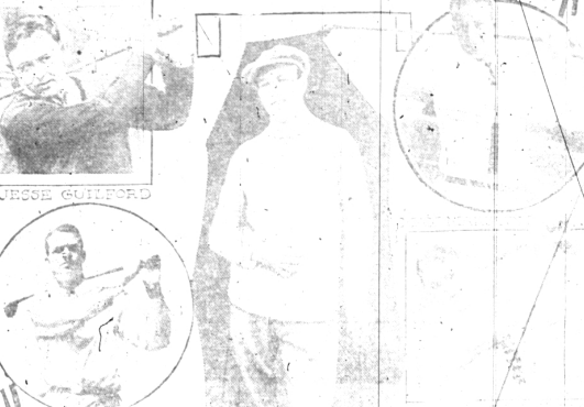
Jesse Sweetser, U. S. golfer, and other players.