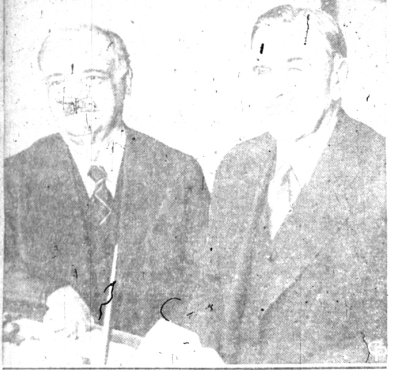
Senator Charles Curtis, R-Kan., and Chairman of the Republican National Committee.