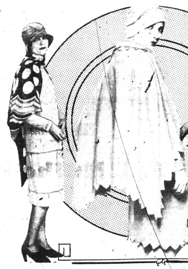
By LUCY CLAIRE Fashion Expert for Central Press and The Eccentric