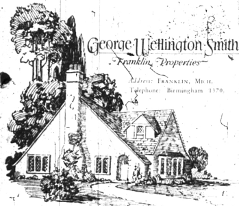
George Wellington Smith Franklin Properties

Franklin Village is ideally situated—secluded, yet accessible from Detroit and in the very heart of the country club district. It is carefully restricted and building sites range from one-third acre to two acres in size. Prices are very attractive, whether you purchase for building or investment.