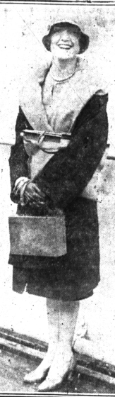
CONSTANCE TALMADGE Miss Talmadge as she appeared on arriving in New York from a recent trip to Scotland.

and support to the work. In fact, the new Commission itself, and we welcome every bit of volunteer assistance which can be had. "The Society has assisted in the holding of clinics in eleven counties this far this year: Alpena, Cadillac, Clinton, Dickinson, Eaton, Ionia, Iron, Muskegon, Ontonagon, Ottawa, and Saginaw. "In counties where the organization of chapters has been effected, and Annual Meeting opened, the enrollment campaign in each county. At this meeting reports relative to the progress of the work are received, officers elected and plans made for the ensuing year. Following this preliminary meeting a series of explanatory held for the purpose of explaining the work and interesting prospective members. "Where chapters have not been formed, plans are under way in many counties for the organization of these helpful branches of the state Society. "It is sincerely trust that the Thanksgiving enrollment will receive the hearty support of every man, woman and child interested in the cause of crippled children. "Splendid progress has been made, and with continued active cooperation, we will press on to the ultimate solution of the problem of the crippled child in Michigan."