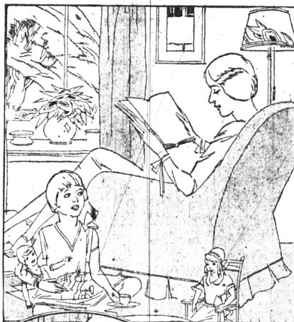
There's no need for spring cleaning in Silent Automatic heated homes.

Come in and let us explain this offer to you. It presents a really remarkable opportunity for a worth while saving.