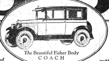
The Beautiful Fisher Body COACH