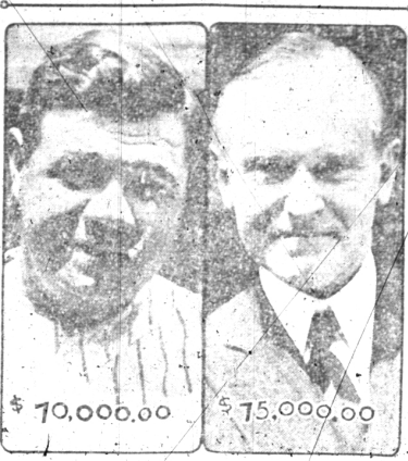
Little boy, when you grow up and may be president—or a ball player, 'Babe' Ruth, left, is to get $70,000 a year for three years from the New York Yankees...