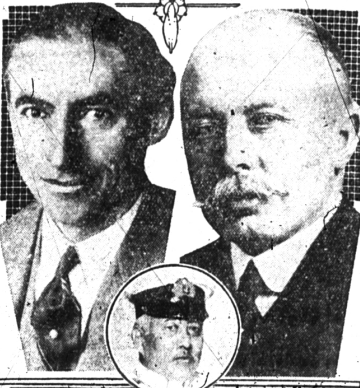
Above are the spokesmen for the three great naval powers at the trination disarmament conference at Geneva called by President Coolidge.

Order Your Coal NOW It's Going To Be Higher Parks Coal Company - Phone 175-R