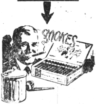
(Cheaper by the Box)