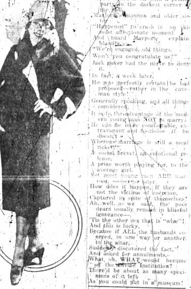
This extremely wearable coat is black with collar and cuffs of black and white calf skin. It is lined with light colored habas. The small hat is gray felt.