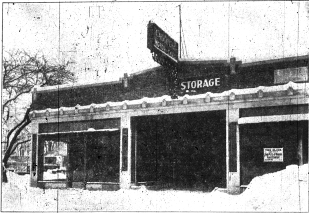
Outside View Showing Cadillac Salesroom and One of the Three Store Fronts