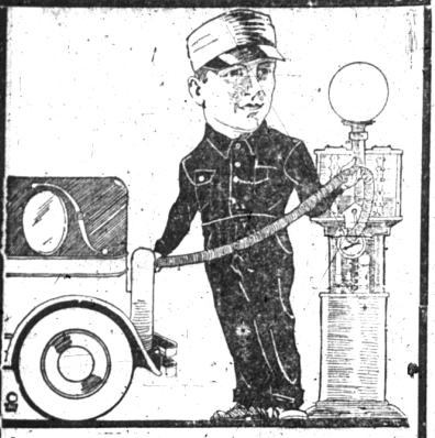
MAHAFFY'S SERVICE STATION S. Woodward at Frank