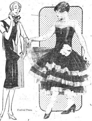
Central Press A black evening gown worn by a young woman is always attractive and is a decidedly serviceable one. The gown is black, with a white net collar and a white net waist. The skirt is of net, trimmed with fringe, and has a dark collar which ties in front.