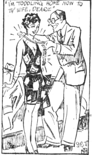
One woman's man is another woman's man.