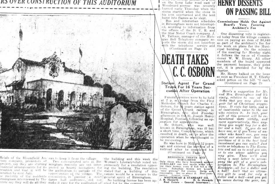
Whether the proposed $500,000 auditorium, the architect's sketch of which is shown above, will be constructed on Woodward avenue just north of Bloomfield court in Birmingham is answered in two different ways today.