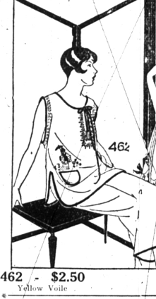
462 - $2.50 Yellow Voile