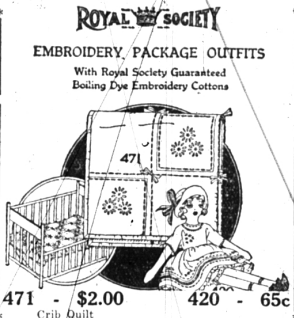
471 - $2.00 Crib Quilt 420 - 65c

Now! is the time to make your Christmas Gifts— New Stock of Royal Society package goods just received.