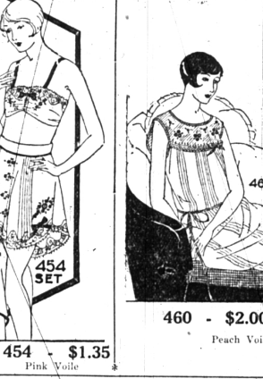
454 - $1.35 Pink Voile

SPECIALS Onyx Pointex SILK HOSE $1.35 Regular $1.65—Special Rollins SILK HOSE $1.25 Regular $1.50—Special All Our Ladies' Wash Dresses $1.79