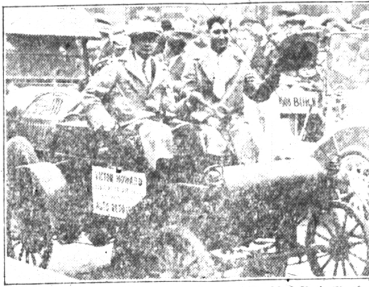
In a recent race of old-time automobiles held in New York City four Oldsmobiles won four of the five races. One of the winners is shown above.

Oldsmobiles woke up the other day, rubbed his eyes and pinched it self to make sure it had not been transported back to 1909 in one of H. G. Wells' "time machines." There, through the heart of the "flying fortress," roared 10-cylinder engines, reminiscent of the days when horses and hairpins were in their prime.