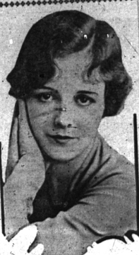
This is the latest picture of charming Mary Astor, the motion picture actress, beloved by the thousands who are witnessing "The Wise Guy," in which she has a prominent part.