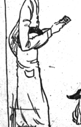
The young lady across the way says she supposes Shakespeare would have lived in history if he hadn't written a thing but Faust.

Love may be misery, but they don't resent the same way to company.