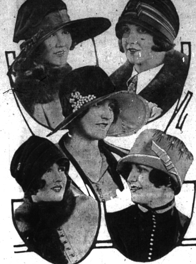
The soft top crown and wide brim are formed of velvet, the wide band and facing are of moire silk.

Birmingham Wallpaper Company 135 W. Maple. PHONE 394