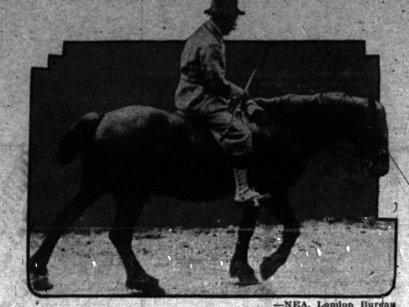
In the picture, His Majesty King George of England is seen setting forth after a grouse. His mount seems a bit heavy for the sport, but in grouse hunting they say patience, rather than pep, is the requirement.