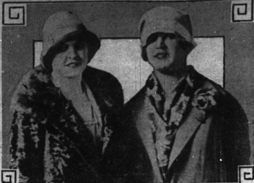
Marion Talley (left) and Gertrude Elderle were rival attractions on the same night recently in Des Moines, Ia. The 18-year-old prima donna drew 2300 auditors, while Miss Elderle, channel swimmer, showed her strokes to a crowd of about 100.