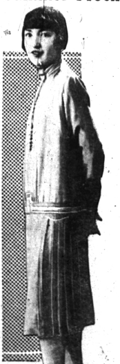
This dress, designed by a famous Parisian tailor, is of maroon tulle and silk, the top trimmed in beige crepe de chine trimmed with tulle. It is especially suitable for the summer afternoon.

For Accuracy McALPINE'S W.S. McALPINE MAP CO.