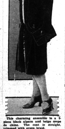
This charming ensemble is a 3-piece black alpaca and beige crepe de chine. The coat is straight, trimmed with green braid.

It is Further Ordered, That public notice thereof be given by publication of a copy of this order, for a period of thirty days, previous to said day of hearing, in the Birmingham Centric, a newspaper printed and circulated in said county. STOCKWELL Judge of Probate. DAN A. MCGAFFEY Register of Probate. 9-10-11