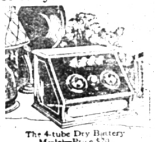
The 4-tube Dry Battery Model—Price $75.

Please call, phone, or write for demonstration, there is no obligation.