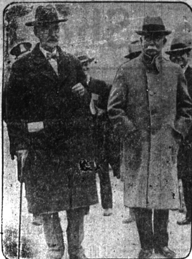
Albert B. Fall (left) and Edward L. Doheny used to prospect together for gold in the mesas of New Mexico. Now they are on trial in Washington on charges of conspiracy to defraud the government, the charge growing out of Doheny's $100,000 gift to Fall several years ago when Fall was secretary of the treasury. Later Fall leased part of the Elk Hills and Teapot Dome Oil Reserves to Doheny, and it is charged the $100,000 was a bribe.

The teachers have helped from the home, and the home cannot give the help unless the ideals are still surrounding it. The dropping of ideals, morals and the making of our homes "merely places to camp in" is, because we as women have become indifferent, to the tide of the mechanical part of life. It has so engulfed us we can see no other. Materially we are clothed in ermine, and fine people, but spiritually we are in sack cloth and ashes. Again I state, women must make the advance by attaching herself to the spiritual forces of life, take hold and hold.