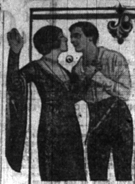
John Barrymore in "Don Juan" and the marvelous Vitaphone Shubert Lafayette Detroit.

(Concluded from Page One) In the center, it is a brilliant yellow, with the surrounding counties, on a smaller scale, in salmon pink. The borders of the Great Lakes and some of the small lakes are in a delicate green, and the roads and lettering are black. A compass and title plate also have plates in their make-up. Distances are given on the roads, so that the reader can tell at a glance how far it is from Pontiac to any point in this vicinity. An index to the hundreds of lakes in Oakland County is given in the book, with a working system for finding them on the map at the back. The annual report of the road commission also is included. Among the shorter articles contained in this offering of the road commission are: "Highways," the "Covert road system of Road Construction," "Traffic," "Good Roads and Good Schools," and the "Super Highway Commission." Statistical reports of taxes, by township and assessment districts, classification of receipts, maintenance, disbursements, are also available in the yearbook as well as a copy of the highway stop ordinance. A traffic census, throwing an interesting light on the number of horse-drawn vehicles used in the country as compared with automotive vehicles, a statement of tractor costs, and a consideration of materials and stores are given. In short, the Oakland County yearbook for 1938 is one of those