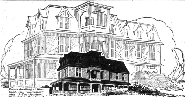
Frame dwellings at Norwood, Pa., "overcoated" with "P-Two-Fourteen" Steel Fabric Reinforced Stucco.