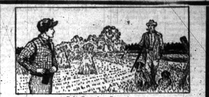
Belt Carrying Case, $1.35