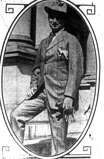
Col. William M. Mitchell

The army officers have elected to meet Mitchell on this ground. The court-martial is not considering the truth or falsity of Mitchell's charges.