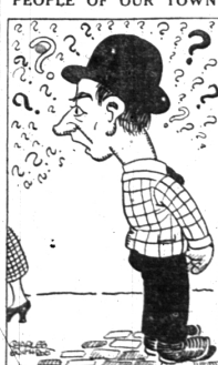
The Poor Burdock is all Worked Up for there's a Stranger in town and he doesn't know her name, nor where she's from, nor why she came, nor how Long she's going to stay, and the Suspense is Killing Him. The Only Explanation for the Volunteer Detective is that he Must have been dropped on his Back when a Babe.