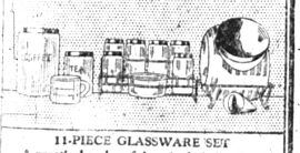
11-PIECE GLASSWARE SET A practical and useful set included with Sellers Cabinet. Metal racks to hold set also included without cost.