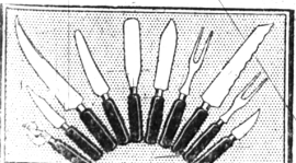
10-PIECE CUTLERY SET Approved by Good Housekeeping. Included with each Sellers Kitchen Cabinet. Material of Special Cabinet. Every piece unconditionally guaranteed.

These 2 Sets Included FREE as Regular Sellers Equipment