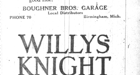
BOUGHNER BROS. GARAGE Local Distributors Birmingham, Mich. PHONE 70

Community House News The ladies of the First Presbyterian Church will hold their annual supper at the church Thursday evening, Jan. 24.