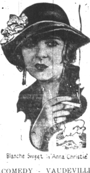
Blanche Sweet in "Anna Christie" COMEDY - VAUDEVILLE

"WAGON TRACKS" "THE WAY OF A MAN" Starting SUNDAY, April 20 For One Week "THE HUNCHBACK of NOTRE DAME"