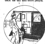
Big loading space by removing rear seat and upholstery.

WE have never seen the public flock to a car the way they're flocking to the new Overland Champion! It's revelation—how much they wanted such a car! Study these pictures—you'll understand. Then realize that the low price also secures regular sliding gear transmission, all standard accessories, bigger new engine, Triplex springs, cord tires, and all Overland superiorities. Come in.