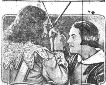
Richard Barthelmess in "The Fighting Blade"

WEDNESDAY, NOV. 21 DOUBLE BILL ETHEL CLAYTON in "The Remittance Woman" and a five-act Indian picture "The Daughter of Dawn"